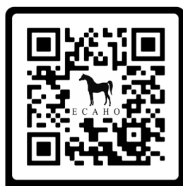
Rules for Conduct of Shows

Only ECAHO approved QR codes are allowed as they guarantee the latest version of the regulations and usage statistics. These QR codes can be downloaded from the ECAHO website.