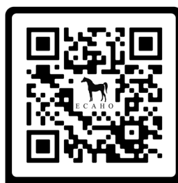
Rules for Sportclasses